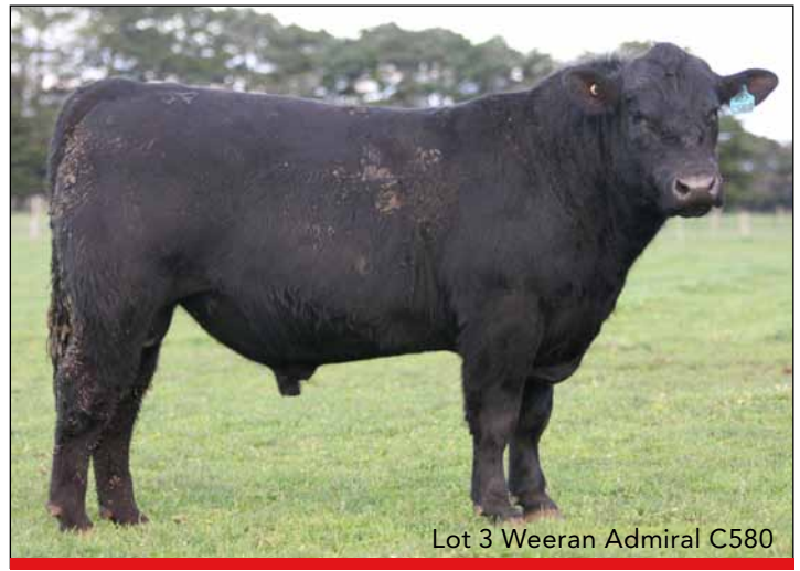
Lot 3 Weeran Admiral C580