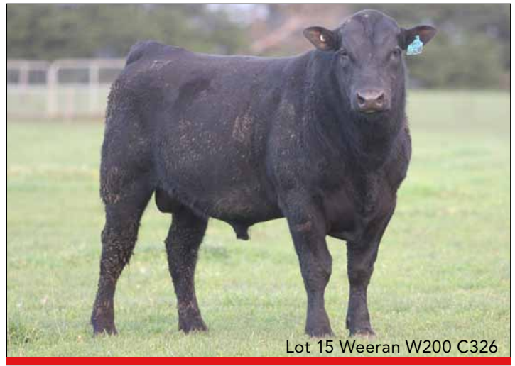
Lot 15 Weeran W200 C326