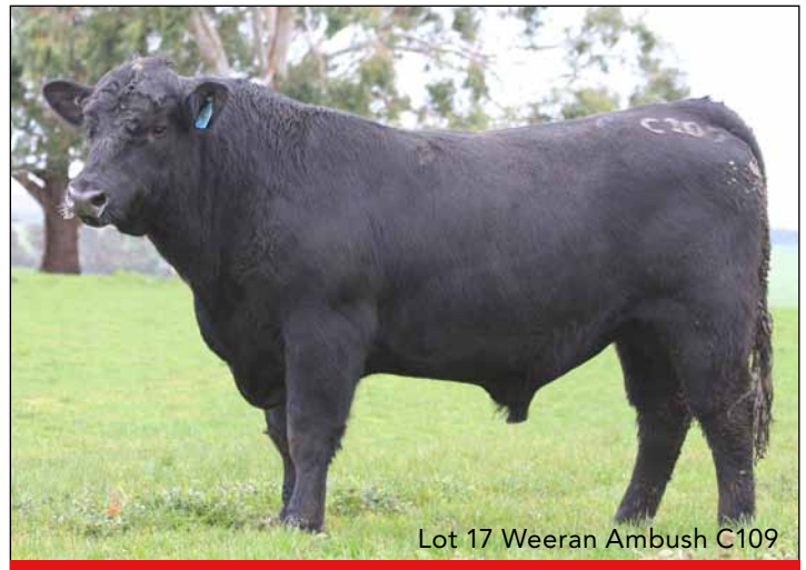
Lot 17 Weeran Ambush C109

The Weeran 620 cow herd has produced some awesome power packed genetics for Weeran's third annual Spring Bull Sale to be held on Friday 11th September. The bulls have been described by Dick Whale as an ' extremely powerful group of bulls '. Sires including X3, X15, Equator, Whitworth and A2 have put plenty of punch into our program.