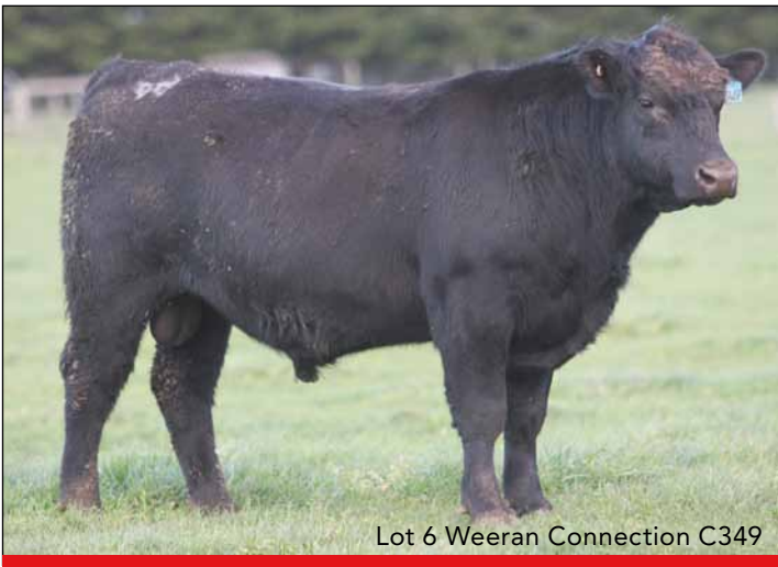
Lot 6 Weeran Connection C349